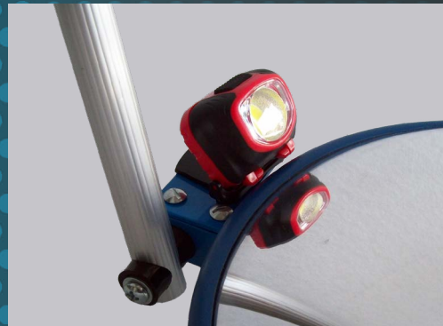
LED BASE LIGHT